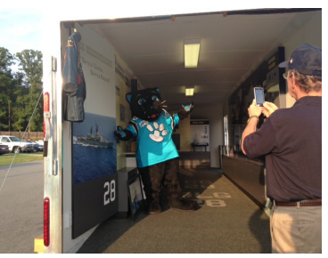
Sir Purr giving his Paw of Quarterdeck instruction approval.