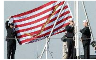
U.S.S. Kitty Hawk (CV-63)

All Ships to Fly First Navy Jack During War on Terrorism Story number: NNS020822-18 Release date: 9/5/2002 11:20:00 AM