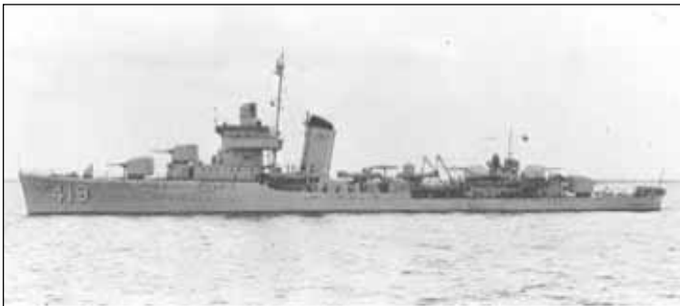
DD419: Keel Laid 7 June 1938. Served in W.W.2

Born in Washington D.C. on 17 December 1849, Rear Admiral Richard Wainwright, the son of Comdr Richard Wainwright, was commissioned in the US Navy on 28 September 1864, Wainwright was Executive Officer of the battleship MAINE when she blew up in the harbor of Havana, Cuba, on 15 February 1898. Surviving the explosion he was assigned to command of the tender FERN and was in charge of the recovery of the bodies of the victims. He also assisted in the collection of information for the subsequent court inquiry. Wainwright later commanded the wooden gunboat GLOUCESTER at the battle of Santiago on 3 July 1898. In this engagement, GLOUCESTER sank one Spanish torpedo boat and drove another on the beach. Wainwright was commended for his valor in this engagement. Later, promoted to Rear Admiral, he commanded the Second Division of the United States Atlantic Fleet during the fleet's historic voyage around the world from 1907 to 1909. Retired from active duty on 7 December 1911, Admiral Wainwright died in Washington D.C., on 6 March 1926.